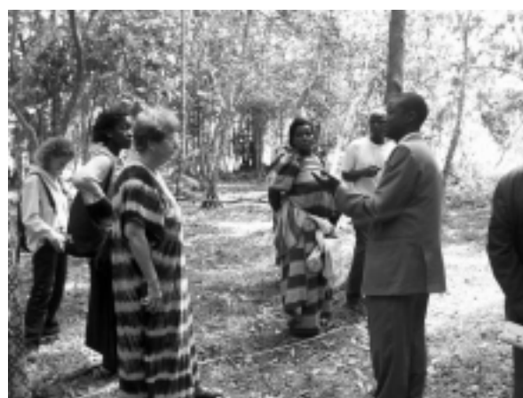
Traditional healers in the forest, where they grow their medicines

We look forward to continuing the International Partnership with OICPC.