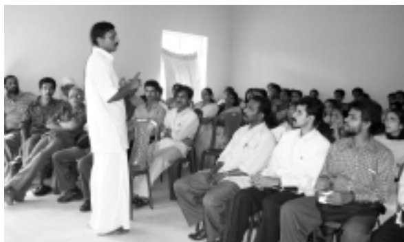
Teaching in Kerala, India - 2003

More than 100 people from Kerala have completed training with the Kozhikode Initiative in Palliative Care (KIP).