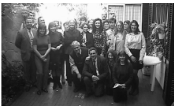
Pallium Latinoamerica Up Date Course on Palliative Care - 2003

Pallium Latinoamerica is a multi-professional team devoted to end of life care in Buenos Aires, Argentina.